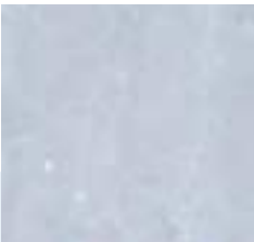
ECOPLATE 5030 film after 1000 hours, 85°C/ 85% RH exposure.