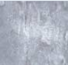
ECOPLATE 5030 film after 96 hours of salt fog exposure.